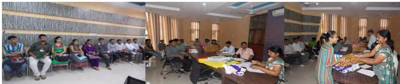
Meeting With the Team Managers of Gandhinagar Zon

A second meeting was organized on the evening of last day of festival i.e. 7th September, 2019 at 5:00 p.m. to get the suggestions and feedback from the team managers. The feedbacks were very encouraging and it reflected the level of high satisfaction from the side of participants and team managers. Every one appreciated the smooth, punctual and flawless execution of the events. They also exclaimed the high cooperation and support by the volunteers and the staff. Few important suggestions were also proposed by them which could further improve the organization in future. A gift was given to all the team managers as a token of appreciation of their cooperation.