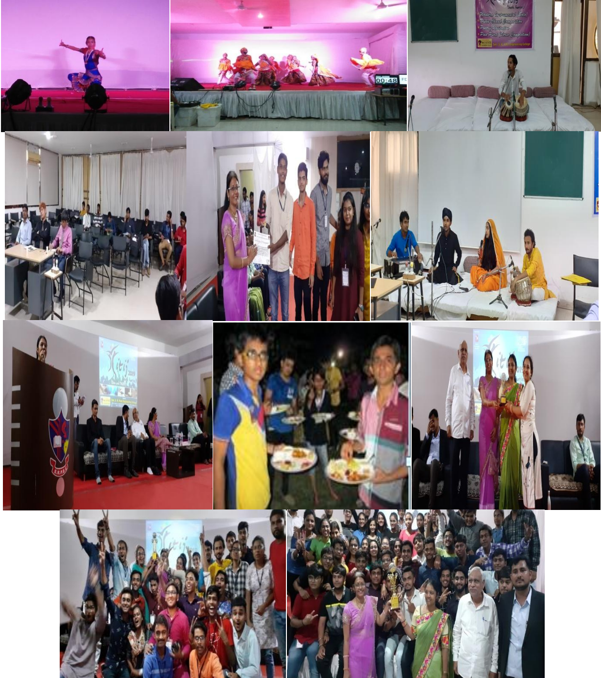
“Xitij 2019” Gandhinagar Zone – The Panorama of Event