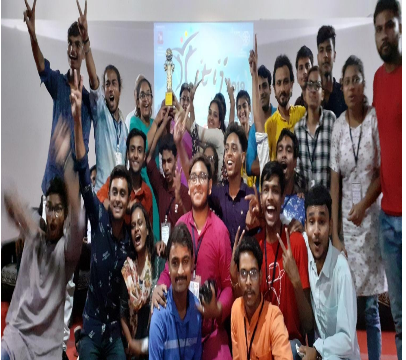
Proud Participants of “Xitij 2019”