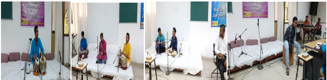
Performances of Folk Orchestra, Western Solo, Light Indian and Indian Group Song events

Events like Light Vocal Indian, Classical Vocal Indian and Western Solo had maximum number of participation. The performances in instrumental and folk orchestra were relatively less performances.