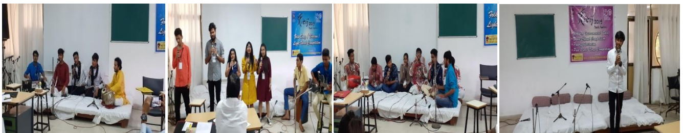
Participants of Western Group, Indian Classical, Instrumental Non Percussion and Percussion