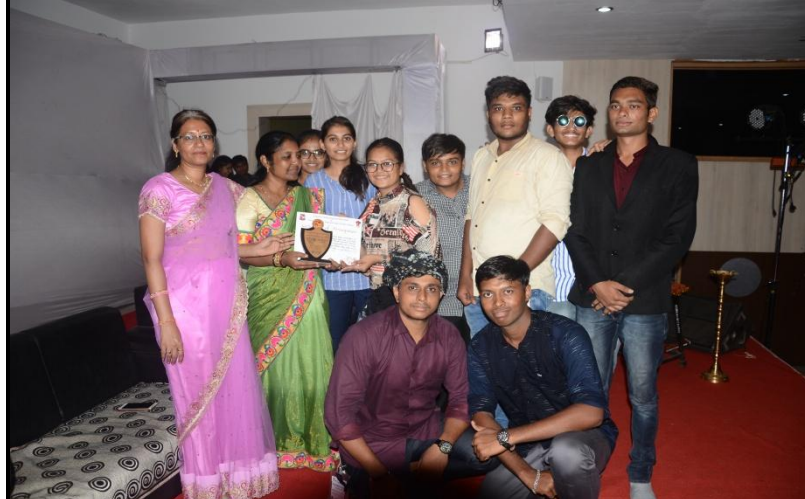
The Valedictory Function of “Xitij 2019”, With the Dignitaries’ and Award given to the Rank Holders by the Chief Guest, GTU