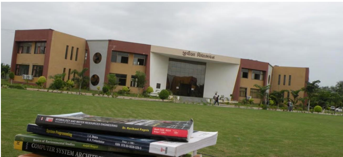
The Green & Serene Campus of Smt. S. R. Patel Engineering College, Unjha - Mehsana “Xitij 2019”, Gandhinagar Zone – A Report

Keeping the same point in mind and to unleash the latent talents in the students it has taken up the opportunity to host the GTU Youth Festival “Xitij 2019-2020” at our premises on 6 th & 7 th September, 2019. This event was successfully executed with great deal of satisfaction to one and all. The institute looks forward in availing all such cause to benefit the students of our region.