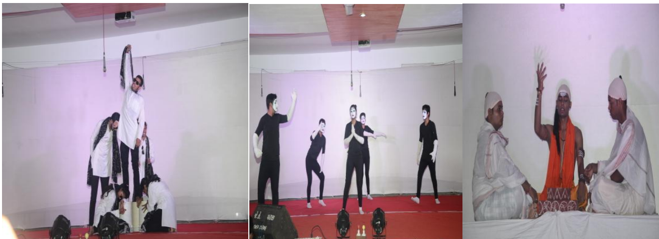
Participants of Skit, Mime, One act play