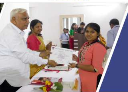
National Unity Day Celebration