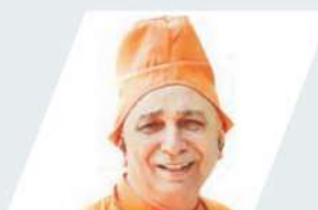
Satchidananda Saraswati Spiritual Master