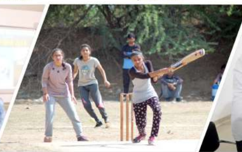
National Tobacco Day