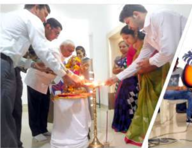
Kashmiri Sufi Song