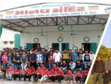
Shiv Ganga School Visit