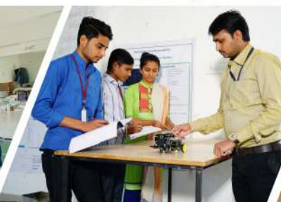
IIT-Bombay E-Yantra Lab